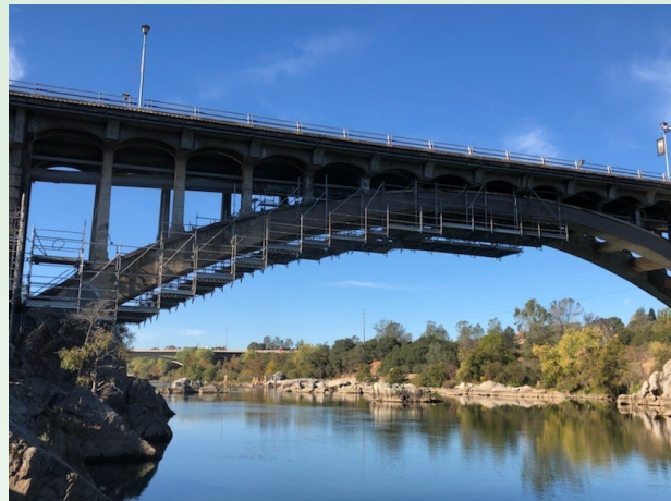
Specialty Locations / Hard Access