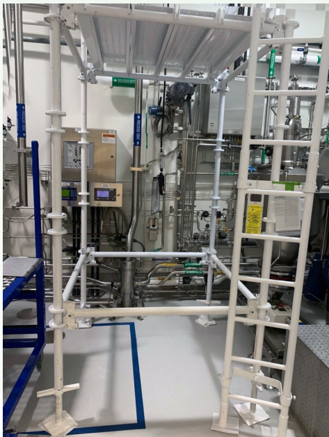
Powder Coated—Ultra Clean